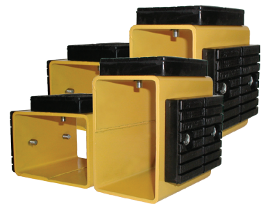
(4) two position adapter blocks