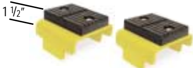
Slip-On Luxury Car Adapters (# 10300)

To accommodate a wider variety of vehicles, our optional pad or frame contact slip-on adapters give you the flexibility to raise just about any vehicle that comes in for service.