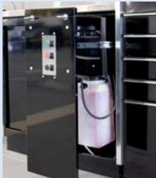
Consult factory for specifics.